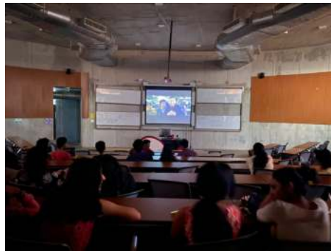
Students enjoying a movie evening on Diwali.