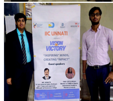
Unnati, hosted by IIC at Woxsen University

Q&A sessions, engaging directly with the speakers to gain personalized insights on entrepreneurship, market strategies, and career development.