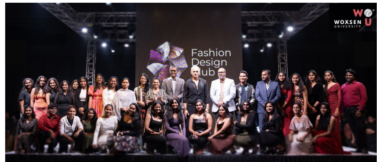
La Mode 2025 at Woxsen University

The excitement began even before the main event at 5:30 in the evening. Groups of friends sat chatting on the rise, tired minds shuffled through their last bits of work inside the block, and then, suddenly, the beat dropped—a flash mob! A wave of dancers stormed the space, their energy filling the air like a spark. Laughter, cheers, and claps followed. It was impossible not to feel the buzz—it was the perfect way to announce La Mode and get everyone pumped for what was to come.