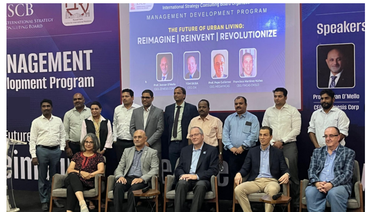
Future of Urban Living by ISCB at Woxsen University.

"The shame is not in making a mistake, but in knowing you've made a mistake and continuing to repeat it."