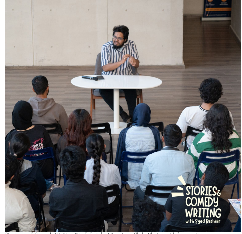
Stories and Comedy Writing Workshop by Literature Club.

In the workshop, Basheer also explained how dark humour can often be misunderstood. Dark humour can be an effective tool for telling stories, but comedy in general is a little bit touchy. "Dark comedy works when it's layered with meaning and not just shock value," he said. Continued, "Humor comes in different forms, like satire, irony, observational jokes, and even completely absurd situations."