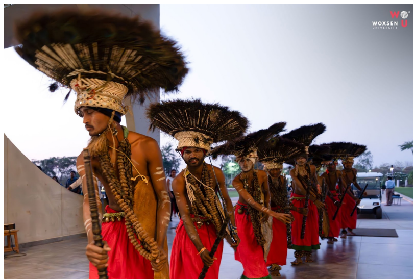
Folk Performance at Woxsen University.

Gussadi is an electrifying traditional dance of the Gond community in Telangana, celebrated during Diwali in the vibrant Adilabad region! Adorned in mesmerizing peacock feather headgear, dancers exhibit high-energy moves and rhythmic beats, invoking divine blessings as they leap and twirl. This spirited group performance embodies the warrior spirit and cultural pride, immersing audiences in the rich tribal heritage and ancestral traditions!