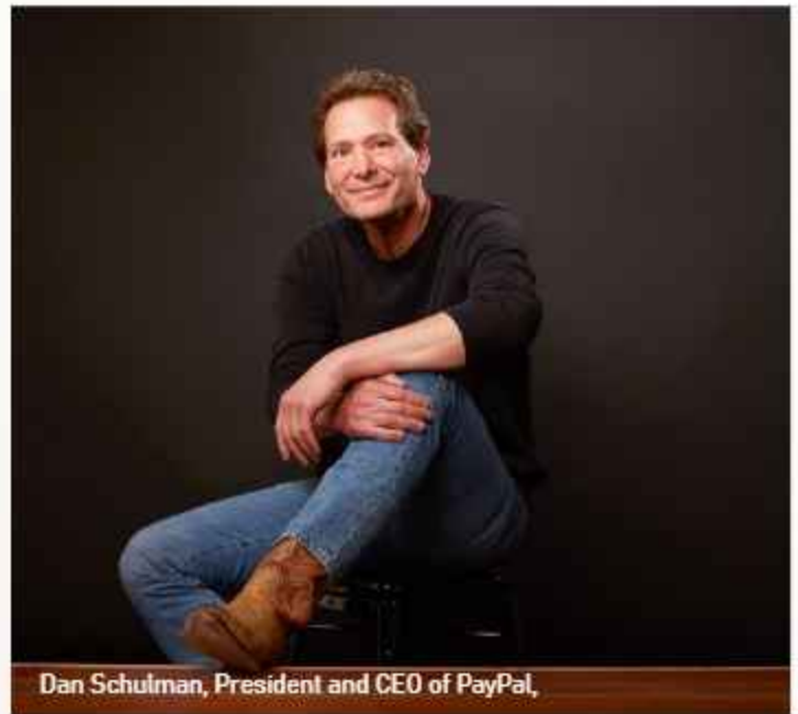
Dan Schulman, President and CEO of PayPal,