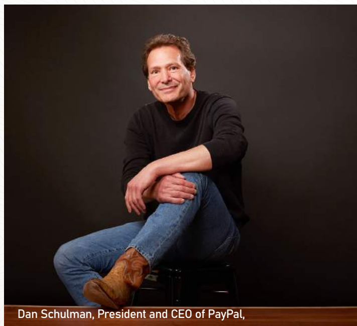
Dan Schulman, President and CEO of PayPal,