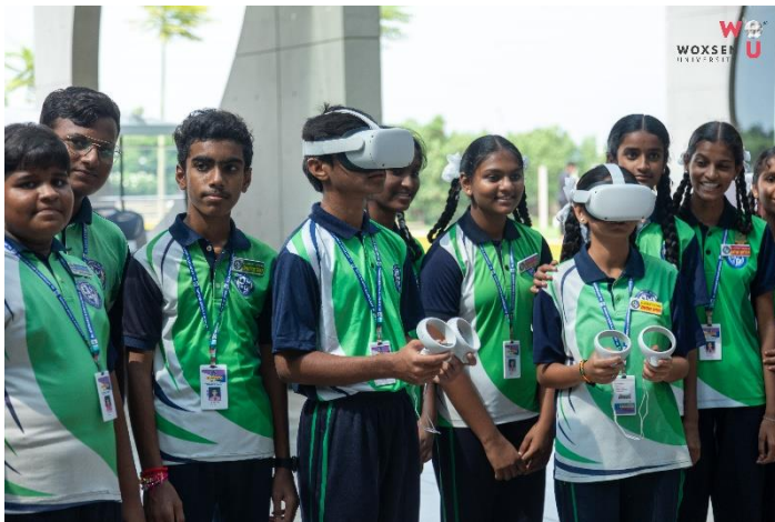
School Students experiencing Virtual Reality

Nearly 100 students from St.Peters High School, Karuna High school, Sri Bashayam high school, St.Antonys School located at Sangareddy and Sadhasivpet participated in the Woxsen Metaverse Odyssey program.